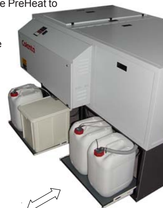
A drawer unit within the main frame to house the replenishment and waste collection tanks. (waste management)